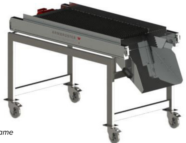
Rollersorter with frame