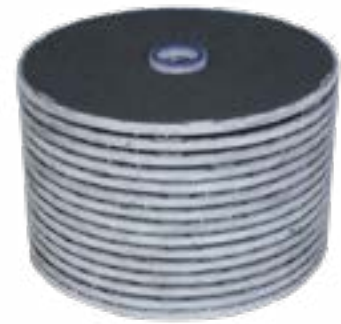
Supradisc I AKS4 Carbon Embedded Module

(cannot be backflushed, do not use with backflush plates)