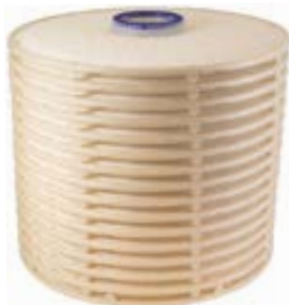
Supradisc I HP Series (dual grade)

(backflushable: backflush support plates recommended)