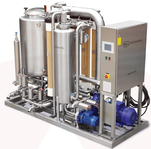
Oenoflow PRO XL-S System

With adjustable operating cycles, Pall's proprietary Low Concentration Volume (LCV) option, and automatic chemical dosing, the Oenoflow PRO XL-S system is the smart solution for reliable and economical wine clarification. Additionally the small batch program provides the flexibility required by most modern wine cellars, packagers and mobile bottlers.